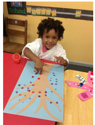
This week we started our unit on Fall / Harvest.

All students finger painted a tree with red, orange, yellow and green finger paints. we talked about how the leaves change colors in the fall time and how they eventually fall down to the ground. The children were very excited to get their fingers dirty and dance around the paper!! we will be working on a variety of fall time crafts as well as learning songs! we hope to have a date picked by next week for our pumpkin picking feild trip which will then take place mid october.